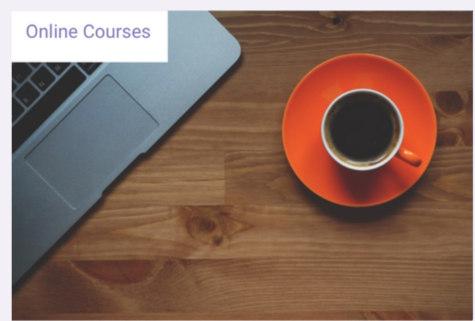
Enrol or continue learning through our online training programmes.

Once you've logged in, please chose the box saying Online Courses