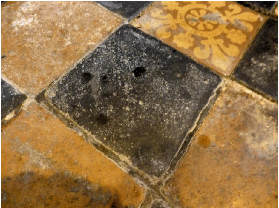
Weston Beggard Church where tiles have been permanently stained by bat urine, made much worse by the addition of a carpet that absorbed the urine.