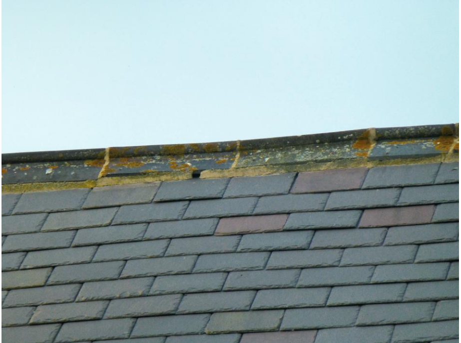
Purpose-made gap under a ridge tile allowing access for crevice dwelling bats

It is always recommended to plan well ahead as bat activity surveys are carried out between May and the end of August and this could seriously delay scheduled works if bats are not considered early enough.