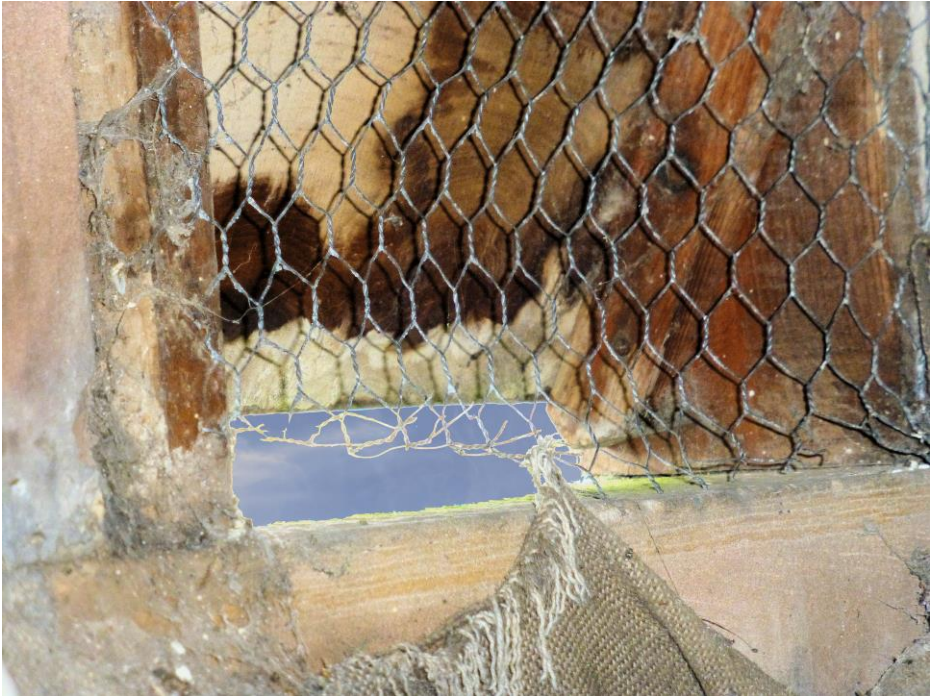
Canon Pyon Church Tower with its new opening allowing bats to enter

Small gaps to allow bats access into the tower, whilst preventing access to large birds, can be created by folding back wire or mesh by a couple of centimetres. It is important to make sure there are no sharp points or edges which can damage bats' fragile wing membranes.