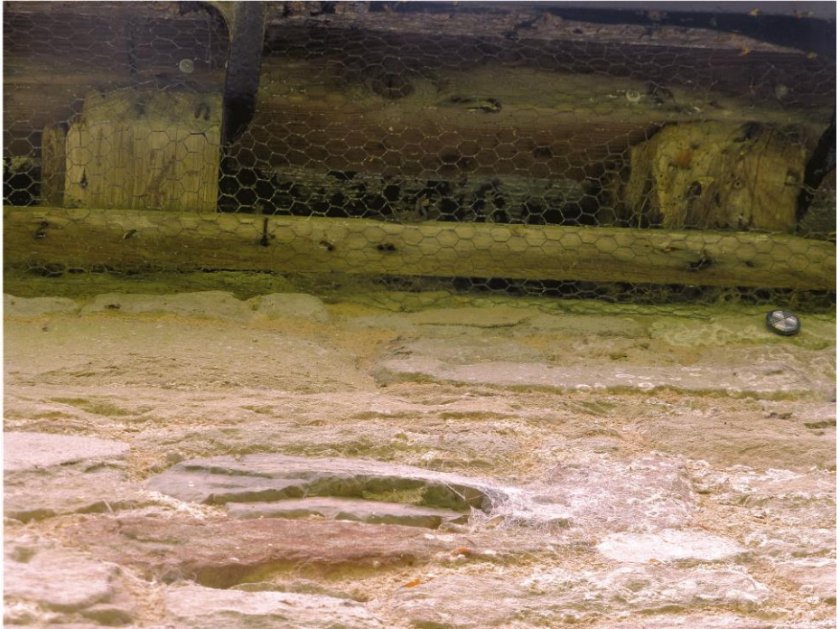
Eaves meshed at a Herefordshire church where swifts were observed locally

is recommended that mesh is inserted inside the church not the exterior. Gaps at the eaves can be restricted to 30mm, which will allow access for swifts and other small birds whilst excluding pigeons and jackdaws. For more information contact Swift Conservation.