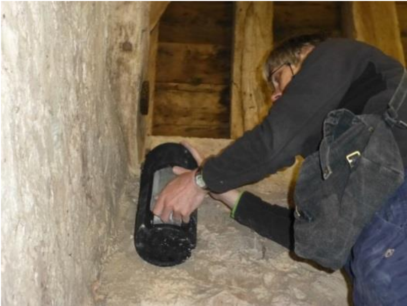
Bat box being installed inside a church tower by an HMG volunteer