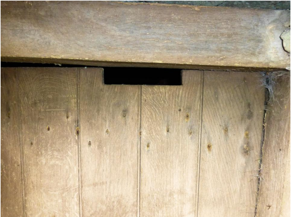
The undercroft at Yazor church has a purpose made cut-out allowing bats access

Many churches have a disused boiler room or an undercroft that may be suitable for roosting or hibernating bats. Small modifications can be made to the door to allow bats access. Wooden bat boxes can be installed in these areas to create alternative roosting sites which may prevent bats using the interior of the church.