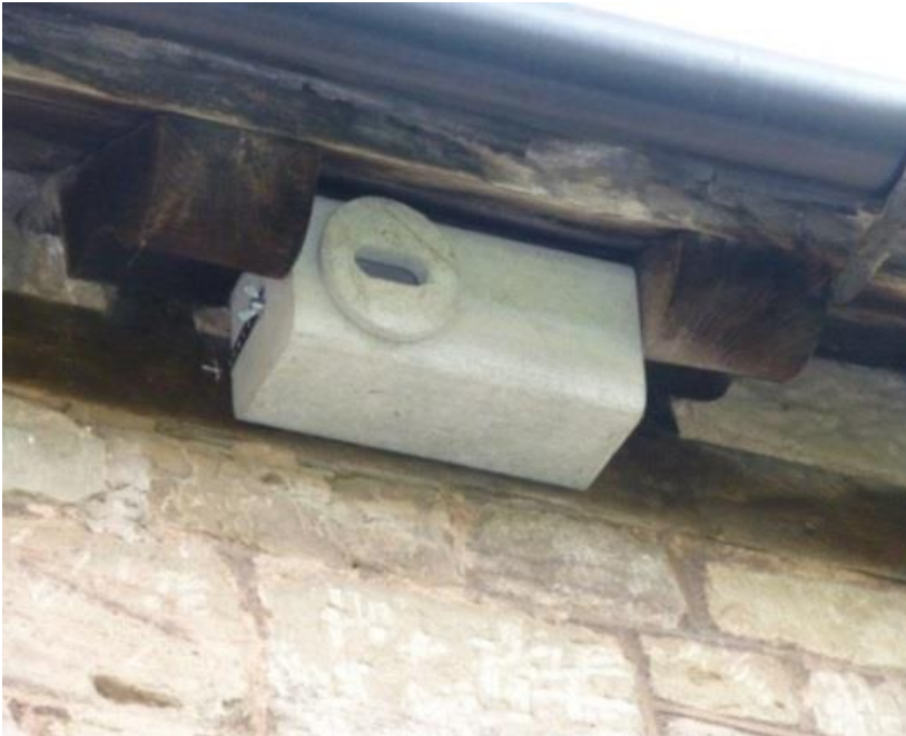
Swift boxes are installed under the eaves